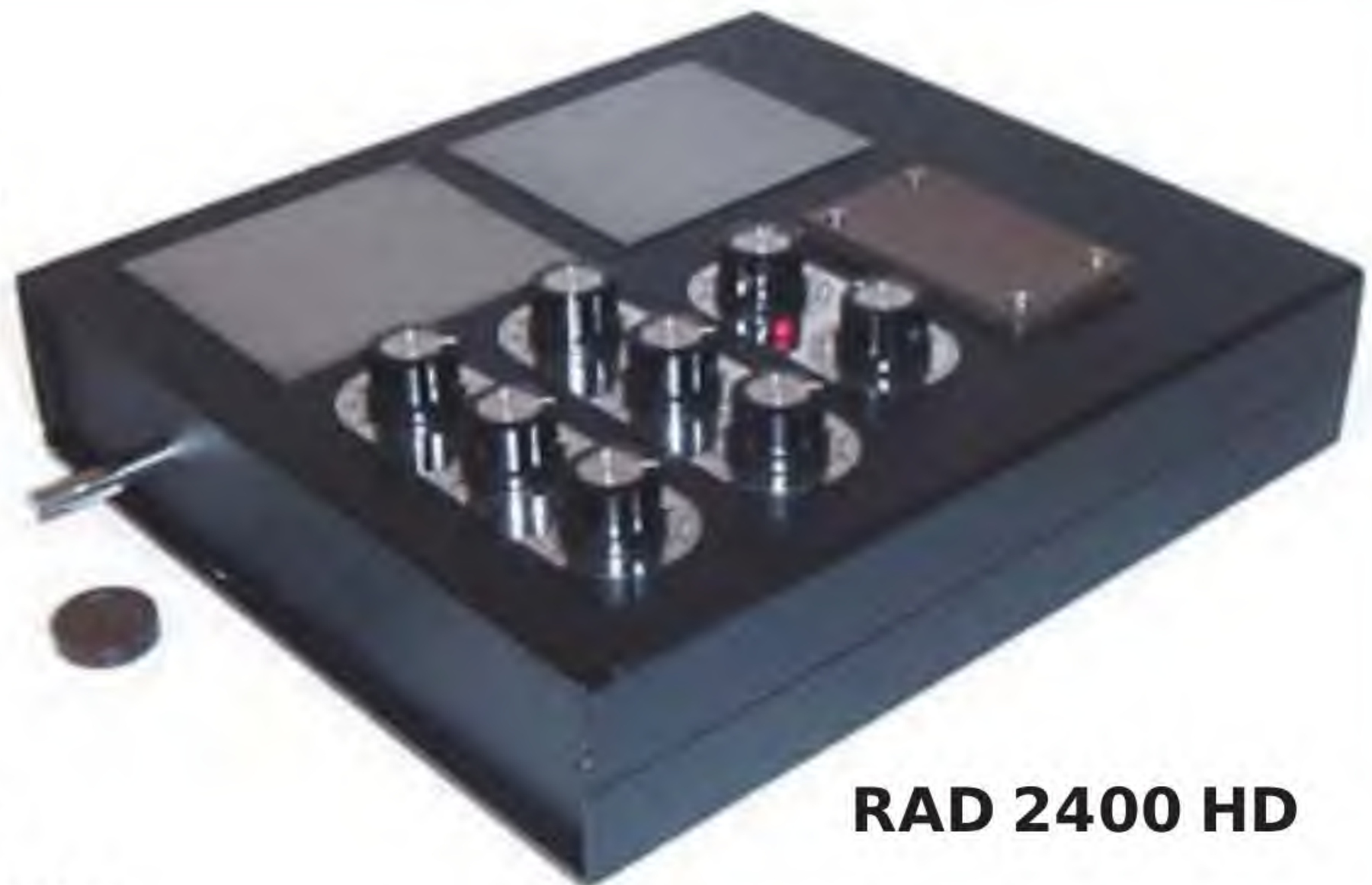
RAD 2400 HD